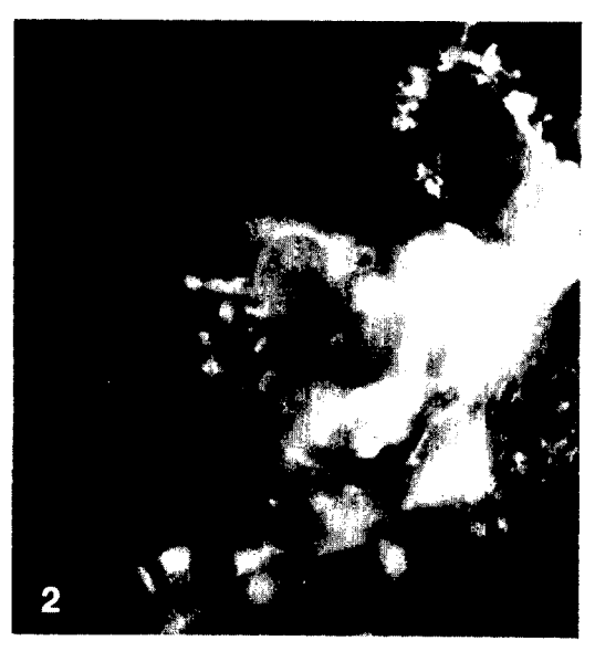
Fig. 2. Binding of fluorescent lectins (Concanavalin A) to the gelatinous matrix of Meloido gyne javanica ( \times 200).

additional proof that this outer membrane contains chitin as one of its components (1). Preincubation of lectins with their re-