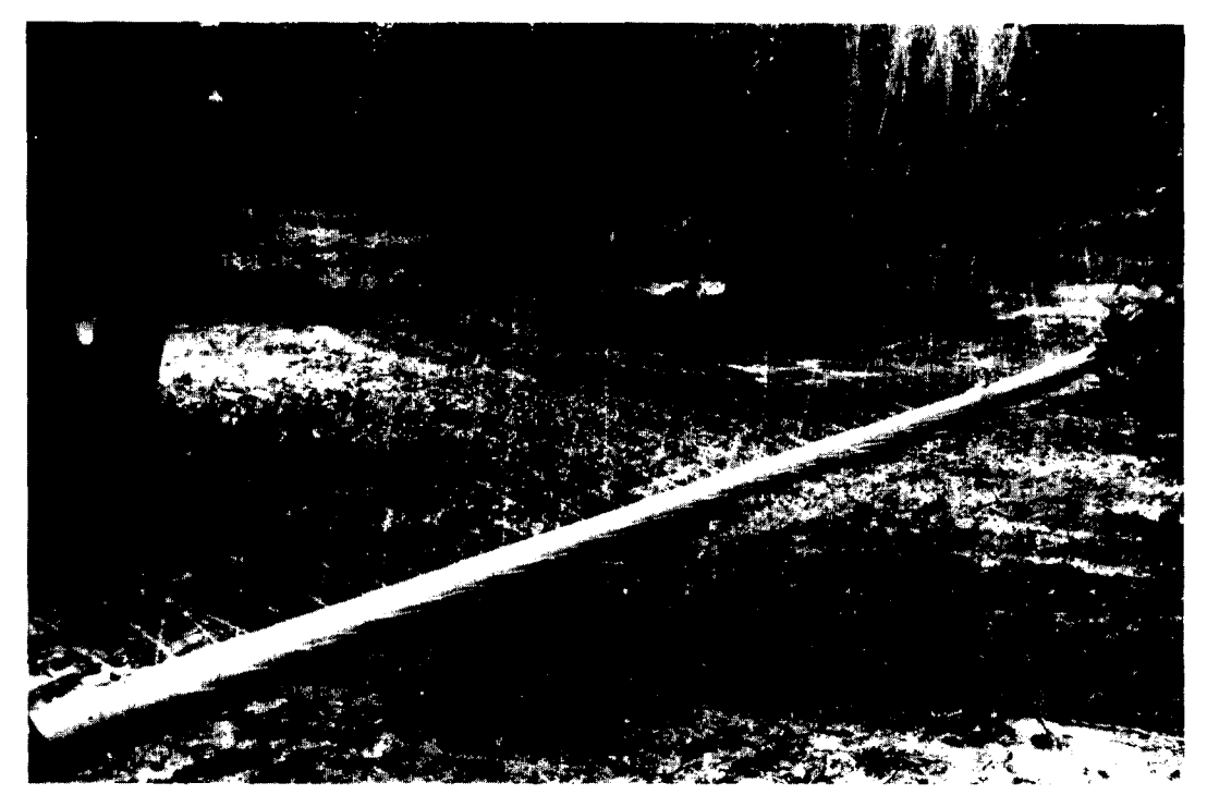
FIG. 1. DBCP emulsion application using special-drilled, low-profile, perforated irrigation ground pipe in a citrus orchard.

(5 inches) diam aluminum pipe with 1.98-mm (5/64-inch) diam holes spaced 152 cm (6 inches) apart and positioned 5°, 10°, 15° and 20° above the horizontal axis. Additional holes were bored 85° above the horizontal axis, alternately spaced 30.5 cm (12 inches) apart to treat row middles (16). All sprinkler pipe applications were made at a line pressure of 1.41 kg/sq cm (20 psi). The treatment sites were pre-wet with 2.5-5 cm (1-2 inches) of water before application of chemicals. DBCP was injected into the irrigation stream during the first 15 min of treatment by air pressure injection systems, by a small power sprayer or by use of a venturi, followed by additional application of water to deliver 5 cm (2 inches) of water. This required 2 h or longer when using standard pipe, but only 20-30 min when using the special drilled pipe, because of the greater number of holes.