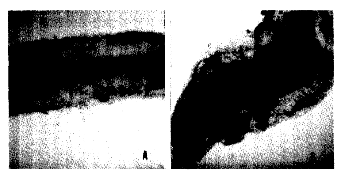
FIG. 2. A-B. Development of M. incognita acrita in 'African' and 'Lahontan' alfalfa varieties (\times 50) : A. 'African'; and B. 'Lahontan', both 7 days after inoculation.

ceptible 'Lahontan' roots, the larvae became sedentary and development proceeded normally (Fig. 2B). Egg production began as early as 18 days after host penetration.