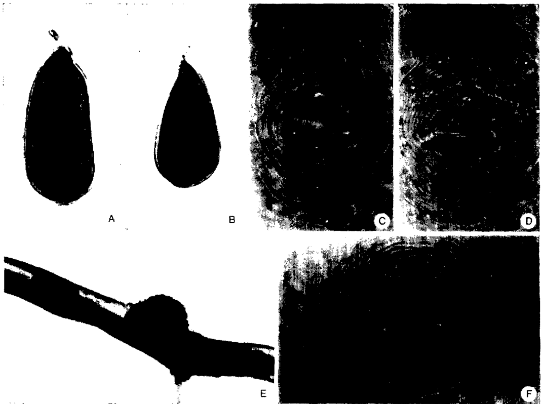
Fig. 1. Meloidogyne aquatilis n. sp. A, B) Mature females showing the slight posterior protuberance and elongate ovoid (A) and pear shapes (B). C-F) Perineal patterns. Note the truncate dorsal arch and fold of cuticle above anus (arrows). D) Perineal pattern at a lower plane of focus than C and F showing the truncate dorsal arch and anus (arrow) below the anal fold. E) Two females completely embedded in the root of Spartina pectinata . Note the absence of gall formation and size of egg mass in relation to the embedded female at right.

(775-874); a = 40 (36-45); b = 4.5 (4-5); c = 103 (96-108); stylet length 14 \mu\text{m} (13-16); spicules 26 \mu\text{m} (24-26).