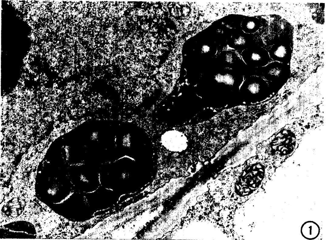
Fig. 1. Plastids (amyloplasts) in a cortical parenchyma cell of tomato root after inoculation with Meloidogyne incognita and incubation in 16 h light and 8 h dark. The amyloplasts contain numerous small starch granules but do not exhibit any atypical membrane structures. × 28,000.

After 1 wk the amyloplasts became more oblate and generally measured more than