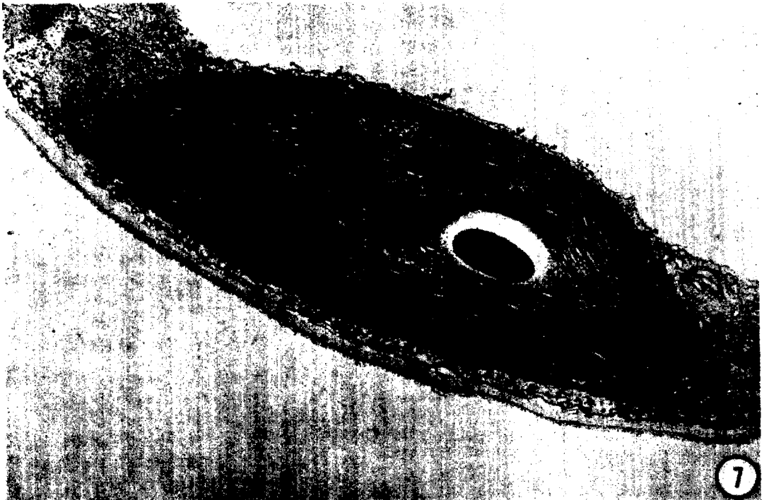
Fig. 7. Mature chloroplast from the leaf mesophyll of tomato. \times 28,000 .