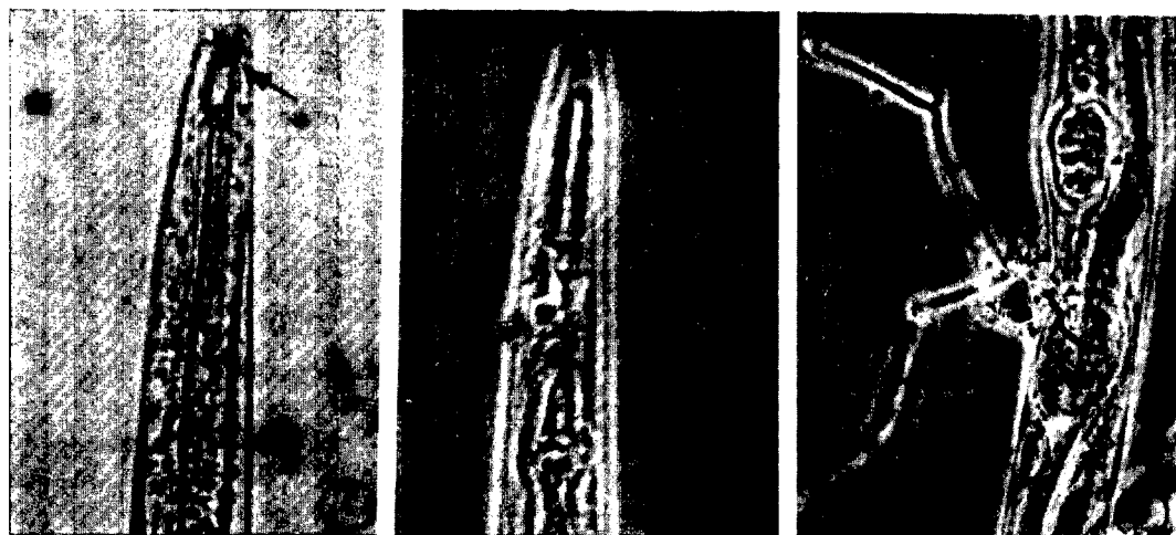
Figs. 4–6. Free-living nematodes infected with Pythium aphanidermatum . 4) Ingested zoospore located in the buccal cavity of a nematode (arrow). \times 840 . 5) Ingested zoospore germinating in the esophagus of a nematode (arrow). \times 625 . 6) Hyphae protruding from from an infected nematode. \times 550 .

Also seen in Fig. 7 were spherical bodies whose identity and function were unknown to Capstick et al. (3) who reported seeing them on the cuticle of infected nematodes isolated from forest litter. We assumed them to be encysted zoospores because of their morphological similarity to ones that were known to be cysts. Another species of Pythium , probably P. disotocum Drechsler (7), also had the same