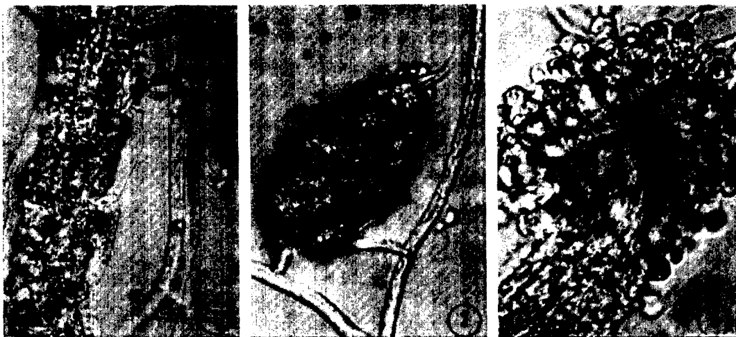
Figs. 1–3. Invasion and consumption of nematodes, and an egg, by Pythium monospermum . 1) Nematodes filled with the hyphae of the fungus. \times 660 . 2) A nematode egg, infected and deformed. \times 800 . 3) Zoospores clustered around the head of an infected nematode. \times 600 .

P. monospermum did not produce any specialized trapping devices in response to the presence of nematodes in the solid agar medium, nor did it secrete adhesive substances in the manner of such phycomycetous nematophagous fungi as Stylopage hadra Drechlsler or Cystopage lateralis