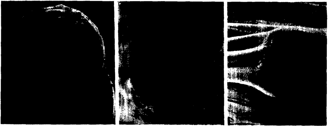
FIG. 3-(A-C). Scanning electron micrographs of Paralongidorus microlaimus . A-B) Anterior region. A) Adult female. B) Fourth-stage juvenile. C) Vulval region.