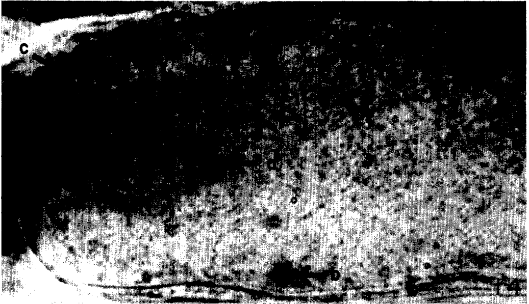
FIG. 14. Egg after second maturation division, sperm pronucleus in cytoplasm (arrow a), first and second polar nuclei, one nucleus not in focus (arrow b), third polar nucleus (arrow c), and 5 chromosomes of the 7 in the egg pronucleus near the third polar nucleus.

The zone in which the two meiotic divisions occurred was very short, consisting of 6 layers of cells or less (Fig. 1b). It was located about \frac{1}{3} the length of the testis from its anterior end. Metaphase I was the first stage at which the chromosomes could be accurately counted; 6 bivalents and 1 univalent were seen (Figs. 3, 4). The univalent was in the center, surrounded by the 6 bivalents in a circle.