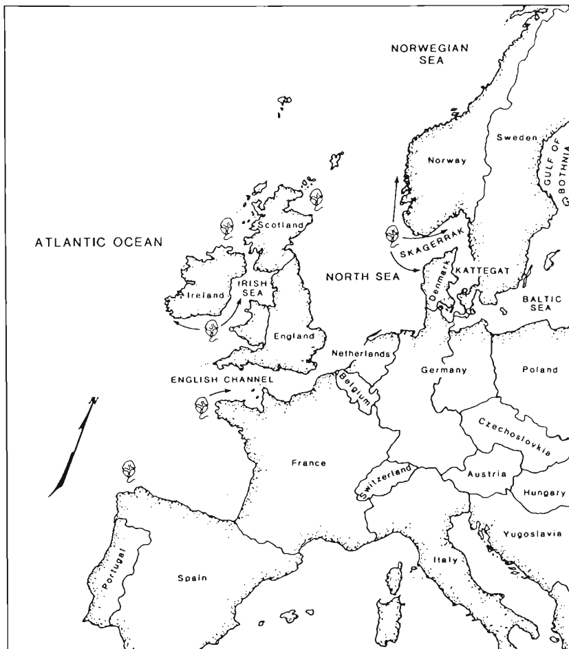
Figure 2. Map of northwestern Europe with regions indicated where known G. aureolum blooms have occurred.