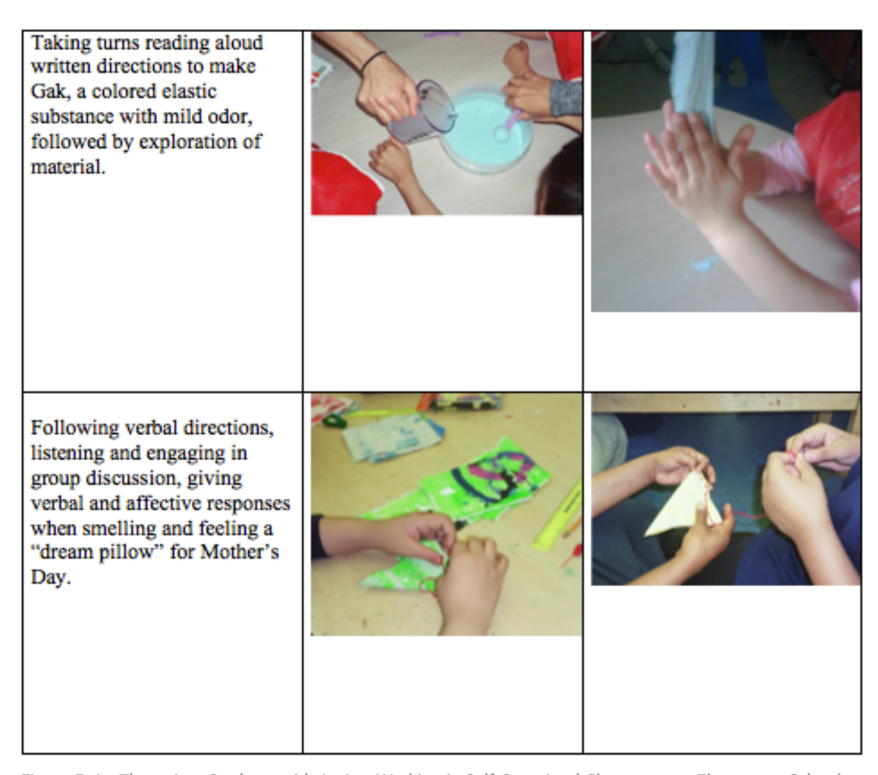
Figure 5. Art Therapists: Students with Autism Working in Self-Contained Classrooms at Elementary School Level (above and middle) and Middle School Level (below).

something and it was really nice that he initiated that...it is encouraging his independence and choice making."