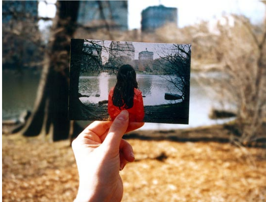
Figure 2. Janet Cardiff, Her Long Black Hair , 2004, Audio Walk with photographs (Cardiff, J. & Miller, G. B. 2004)

Many of Cardiff's walking pieces aim to utilize invented fictions to develop an aesthetic engagement with place for the viewer. A press release for Cardiff's 2004 audio walk through the pathways of Central Park in New York City entitled Her Long Black Hair [Fig. 2], describes how the work succeeds at "interweaving stream-of-consciousness observations with fact and fiction" (Public Art Fund Press Release, 2004). Through the immediate sensations of bodily