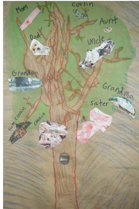
Figure 3a. Student art example, Mary Longman Inspired Family Tree .

One observation made during the research study was that the students were observed as being engaged learners who