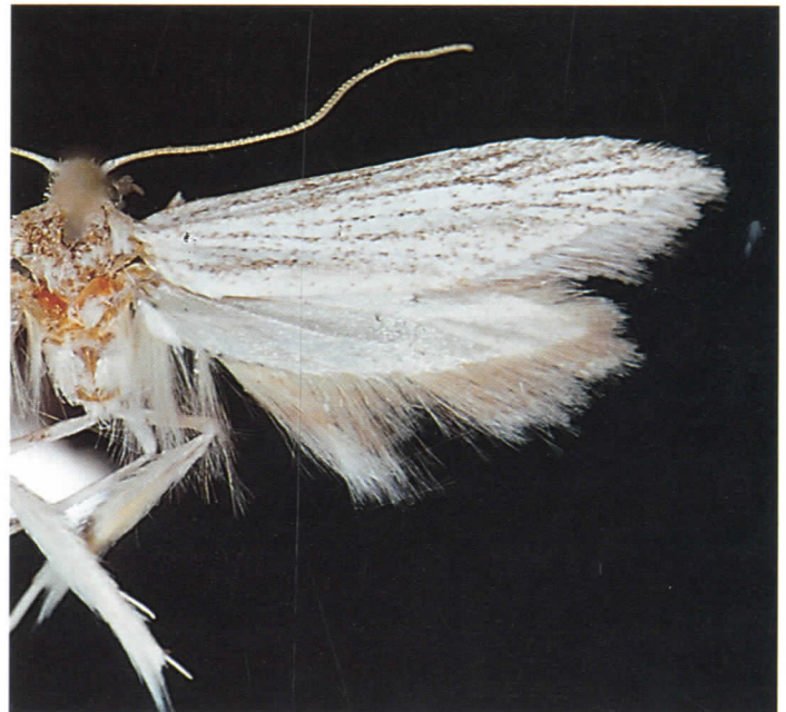
Fig. 1. Pterolonche inspersa adult (Spain) (photo courtesy of A. Vives-Moreno).

Recent studies for the biological control of European knapweeds ( Centaurea spp., Compositae), accidentally introduced into parts of western North America, have resulted in the discovery that one species of Pterolonche feeds on the roots of several knapweeds in southern Europe (Harris and Cranston, 1979). Studies to possibly introduce Pterolonche inspersa Staudinger into the USA as a biological control agent for the knapweed plant pests have resulted in the first biological information for the family (Campobasso et al. , 1994; Dunn et al. , 1989). These studies on P. inspersa have also provided the first larval specimens for detailed morphological study. Previously, cast pupal skins and some larval specimens of another species, Pterolonche pulverulenta Zeller, from Tunisia, were available for study, which