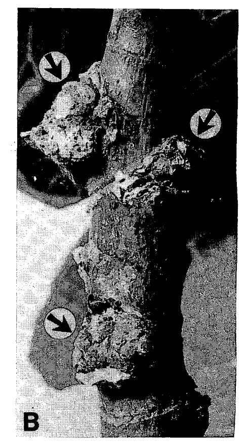
Fig. 2. Ficus carica 'Lemon' infected by Kutilakesa pironii. A) A stem gall at the leaf axil (ca. 0.3X). B) Closeup of three stem galls at leaf axils after leaves have abscised (ca. 2.3X).

reported in Florida in the Western Hemisphere which suggests that this fungus tends to be adapted to latitudes with relatively mild climates. Further, this pathogen has the potential of becoming a serious problem throughout a wide range of crops (4, 5), particularly where wounding or injuries, natural or man-made, are common-place such as in ornamental horticulture wherein vegetative propagation is a normal and common practice. In such instances, the application of an appropriate and effective fungicide prior to pruning or taking cuttings would be most desirable to