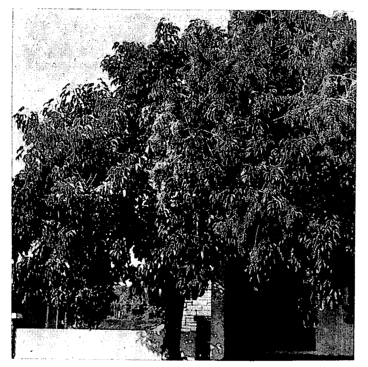
Fig. 3. An 11-year-old bishopwood tree with one-half bearing heavily. The leaves on the bearing branches are yellowish; on the non-bearing branches, deep-green.

In addition, it became evident that the tree was outgrowing its allotted space in home gardens, that it has aggressive, far-reaching surface roots; also that branches that bear fruit die back and in succeeding years other branches fruit and die back, leaving large gaps in the crown, and the tree becomes progressively more unsightly. Topping the tree and rapid regrowth produce a temporary improvement until the resumption of the branch fruiting-and-dying cycle. Eventually the property owner cuts the tree down entirely and, like Dr. Simpson, must take drastic steps to overcome vigorous sprouting from the stump.