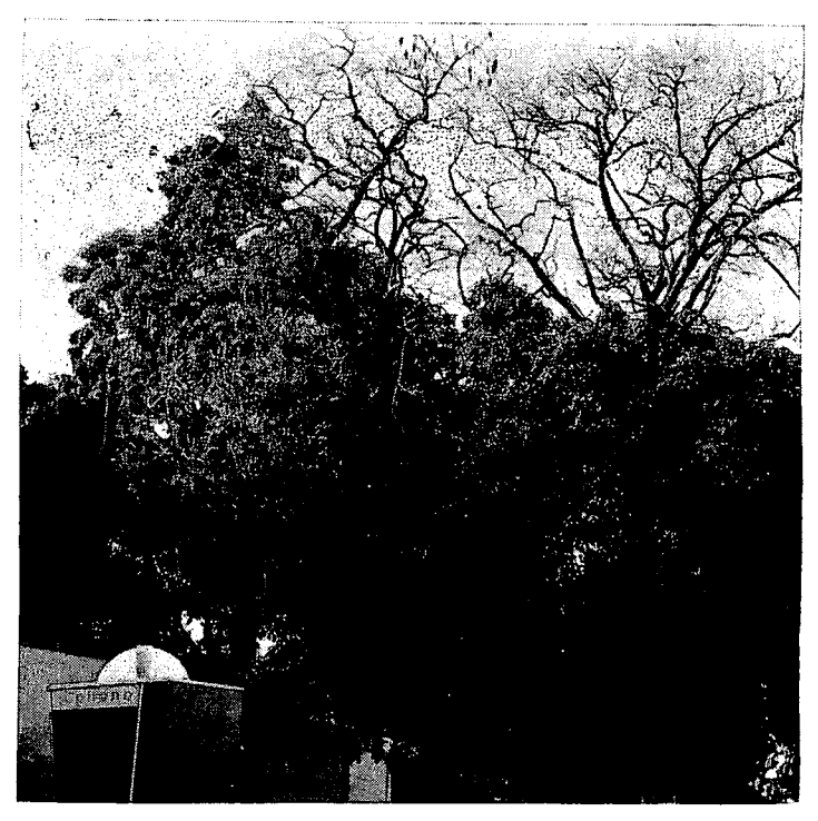
Fig. 4. Upper branches of this large bishopwood tree, receiving most light, have fruited heavily, a few at a time, over the years and have died successively. The tree is an ugly sight and a massive disposal problem. (Photo by Julia Morton).