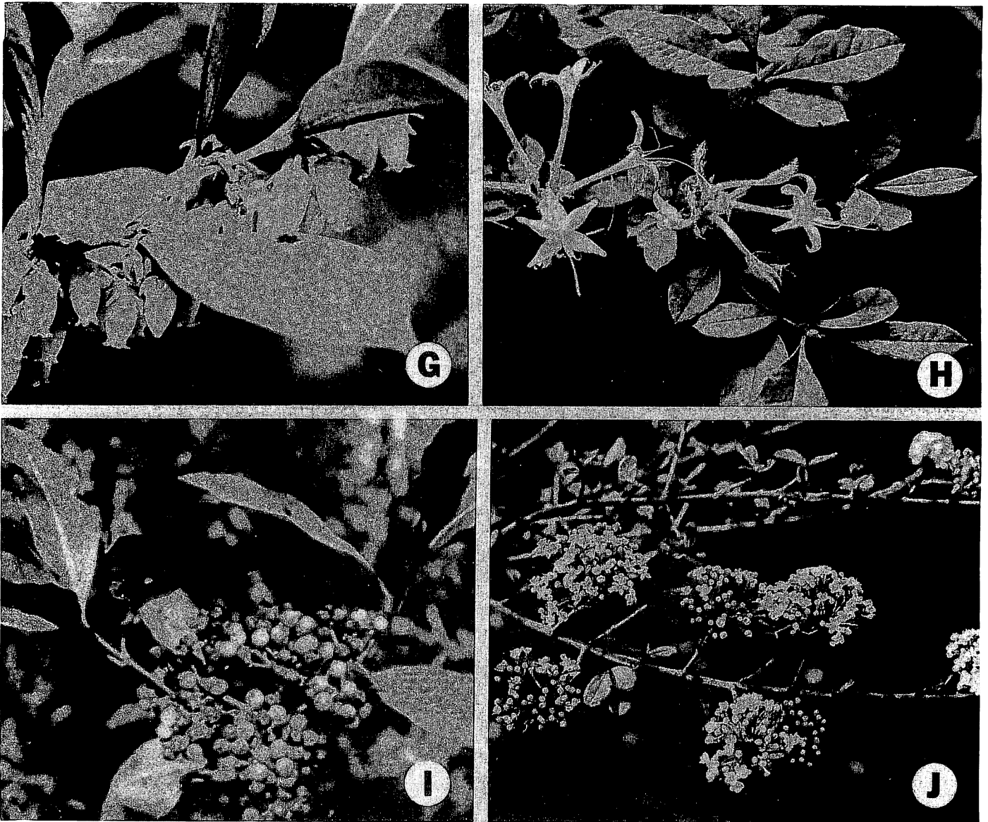
Figs. G-J. Foliar and reproductive characteristics of Florida native shrubs: Fig. G. Lyonia lucida (shiny lyonia); Fig. H. Rhododendron serrulatum (swamp honeysuckle); Fig. I. Viburnum nudum (possum haw); Fig. J. V. obovatum (Walter viburnum).

and endogenous auxin production to be associated with meristematic activity (1, 14). In softwood cuttings roots often initiate without the aid of exogenous auxins during the active growth period, as exemplified by this and other studies (see for example 5, 6, 7). It is also not surprising that subterminal cuttings root best in the latter part of the season. As rainfall decreases and temperature rises, levels of endogenous auxins as well as carbohydrates (20), are depleted in young growth but somewhat higher amounts are stored in the older portions. Thus, while terminal cuttings root easily in early spring, subterminal and basal cuttings are more apt to root later in the season (17).