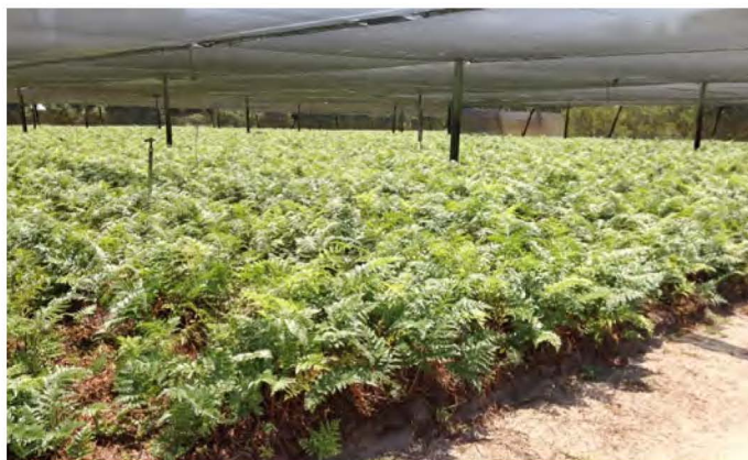
Fig. 1. Typical leatherleaf fern shed (saran structure) used in production.