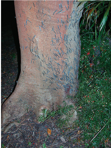
Fig. 2. The “river of caterpillars” streams up a royal poinciana trunk. Melipotis acontioides is a night-feeder and races up the tree trunk shortly after sunset in great numbers as if a dinner bell had sounded.