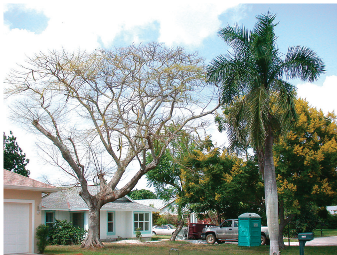
Fig. 1. Melipotis acontioides caterpillars defoliated this 35- to 40-ft royal poinciana tree in Naples, FL. Picture was taken on 28 Sept. 2006. In 2006 there were at least four 30- to 40-ft royal poincianas that were 50% to 100% defoliated by 10 Oct.

DESCRIPTION. The full-grown caterpillar is 1-5/8 inches long with highly variable markings, mottled, lateral black-brown longitudinal stripes with a brownish pink, mid-dorsal stripe that bears four to five diamond-shaped spots (Fig. 3). The moth's front wings are typical for a cutworm—dingy brown-gray with scattered dark brown shadings and dark brown zigzag markings at the wing tips. The most unique characteristic is the color pattern