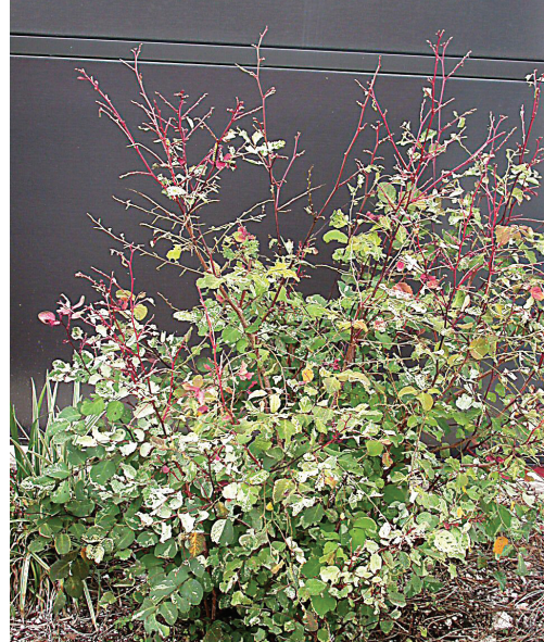
Fig. 4. Snowbush caterpillars start feeding at the top of the shrubs and work their way down—even stripping the bark off when the foliage is gone.