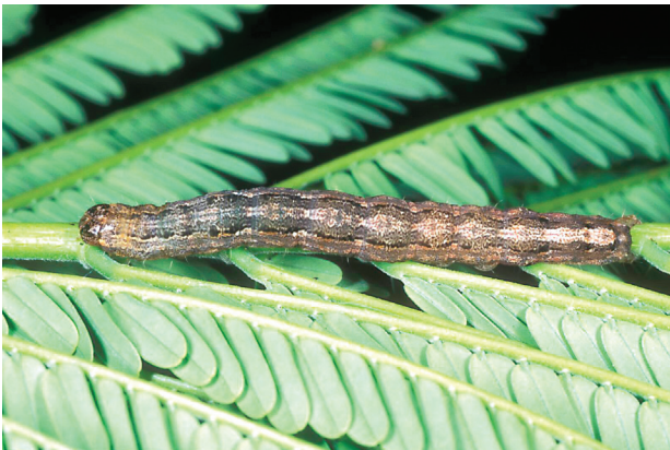
Fig. 3. The full-grown royal poinciana caterpillar is about 1-5/8 inches long.

of the hind wings. Each hind wing is mostly white with a brown blotch toward the edge. The wingspread is about 1-1/2 inches.