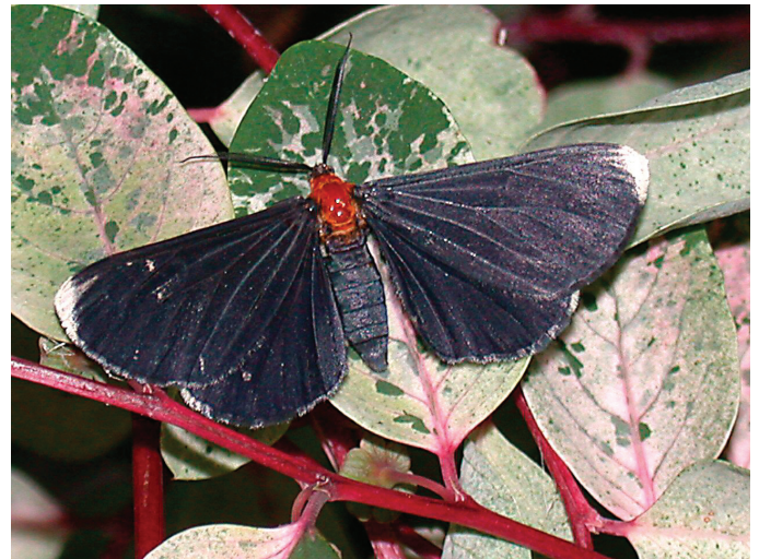
Fig. 7. The wings of the snowbush moth are a velvety, navy-blue-black with white margined tips plus an orange thorax. The wingspread is a little over 1 inch. It is sometimes referred to as the white-tipped black moth.

Management suggestions include pruning the new growth when the chewing has started, as the larvae do not seem to climb back readily. A pesticide containing Bacillus thuringiensis ( B.t. ) or a horticultural soap or a pyrethroid may be needed if repeated attacks occur. Considering that the plants are not too expensive, they may be easily replaced. More information is needed on predators and parasites and egg production of the females.