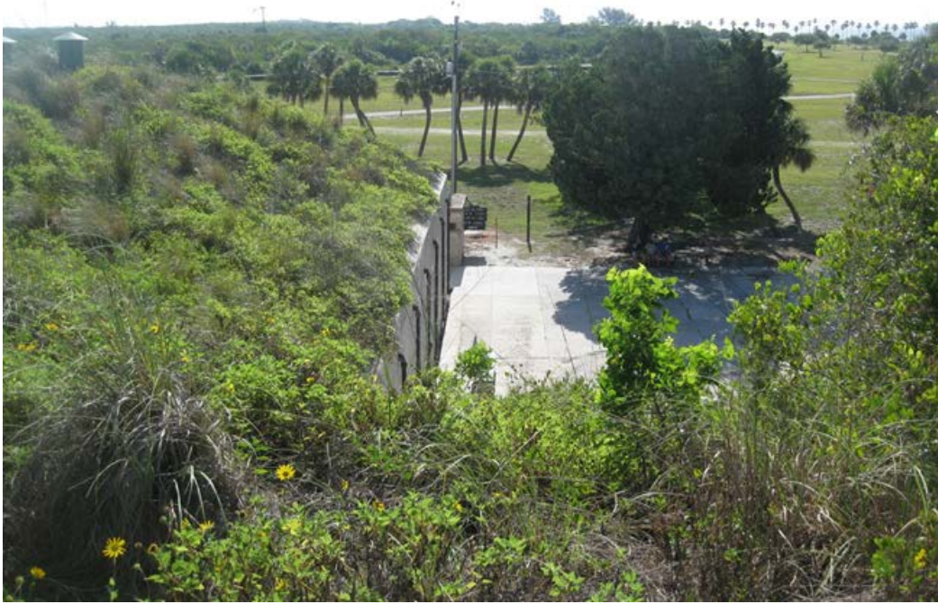
Figure 2. Camouflaged and Vegetated Fortifications at Fort De Soto