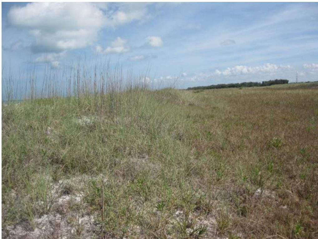
Figure 5. Sea Oat Stabilized Dune Planted in 1998, Ft. De Soto Beach