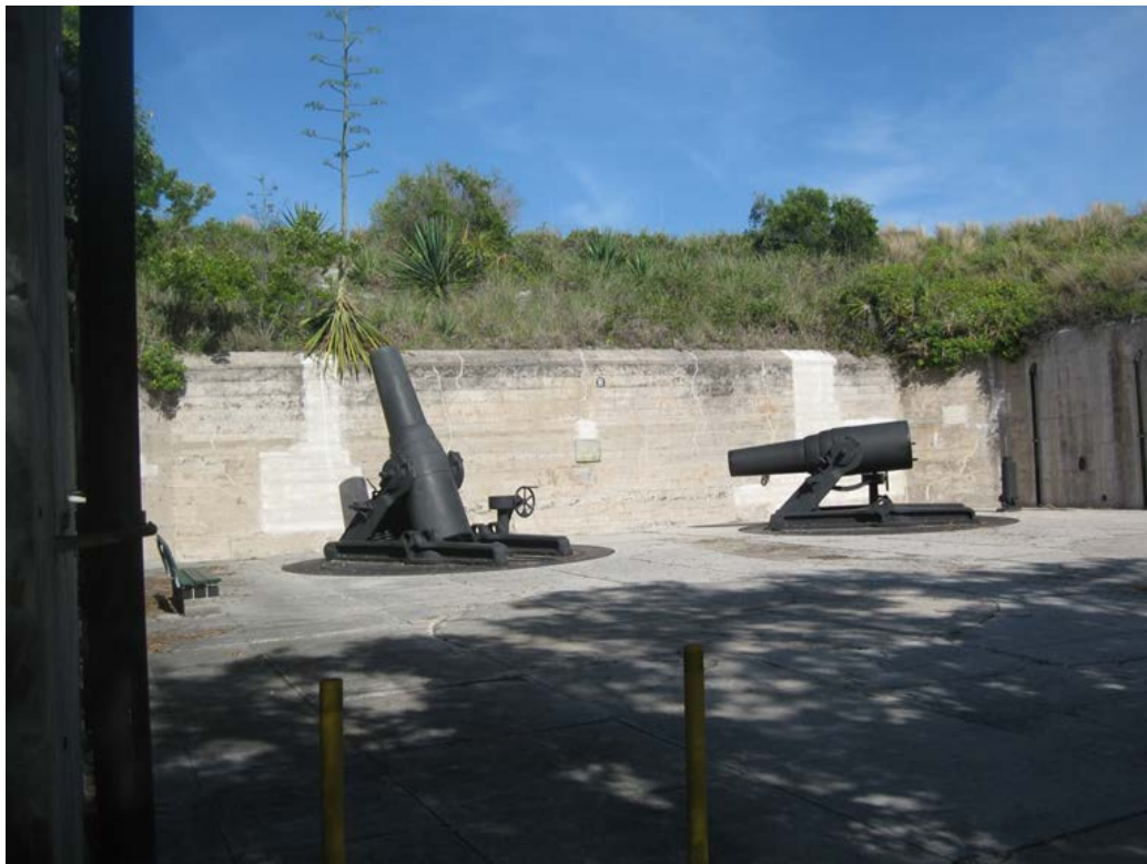
Figure 3. Mortars behind Poured Concrete Walls