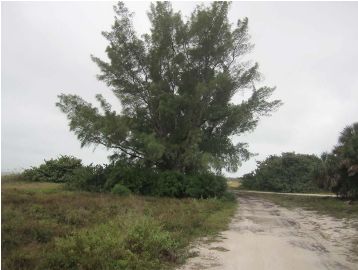
Figure 6. Australian Pine at Ft. De Soto Park

Australian pines ( Casuarina sp., Figure 6) were introduced to Florida around 1890 to provide shade, serve as windbreaks, and for erosion prevention (Teachers Guide, 2014). Not related to pines, they are evergreen and quickly became a part of the landscape. They are droopy, gray-green, needle leaf-like, and often large trees. The leaves are actually not like those of familiar conifers, such as white or red pine, but are segmented, like horsetails. They are invasive and regarded now as pests for a number of reasons. First, they readily propagate on poor, sandy soils. They resist the toxic effects of salt spray and thus can survive on the inland side of beaches. Their ability to fix nitrogen gives them a competitive advantage over slower growing and reproducing species native to the Florida Peninsula. Additionally, Casuarina sp. is also allelopathic in that it suppresses the growth of native species through the release of a toxic substance in the leaf litter beneath the trees. The understory of these trees is nearly void of any other plants.