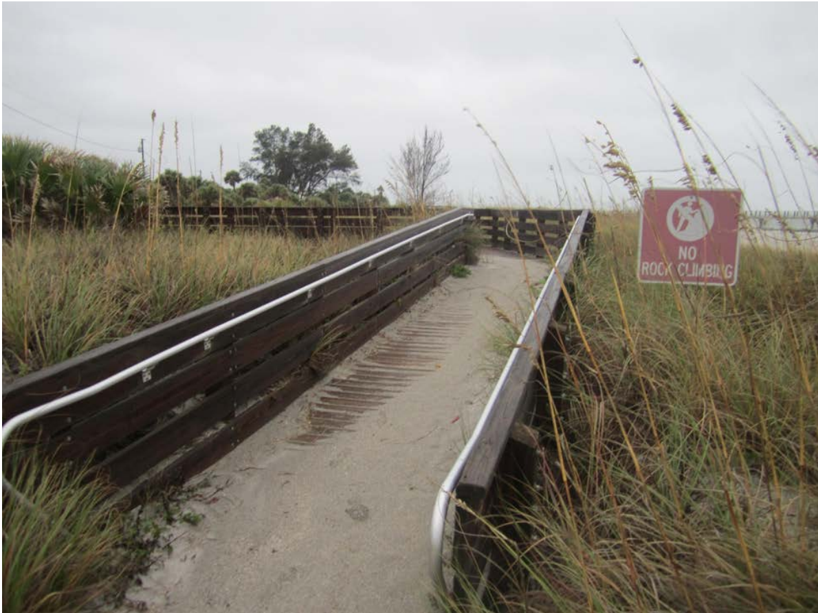
Figure 8. Beach Access Ramp Parallels the Long Axis of the Beach

design allows for handicap access to the beach where the ramp parallels the dune face instead of cross-cutting it (Figure 8).