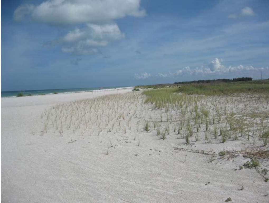
Figure 4. Newly Established Sea Oat Plantings, Fort De Soto Beach (2014)