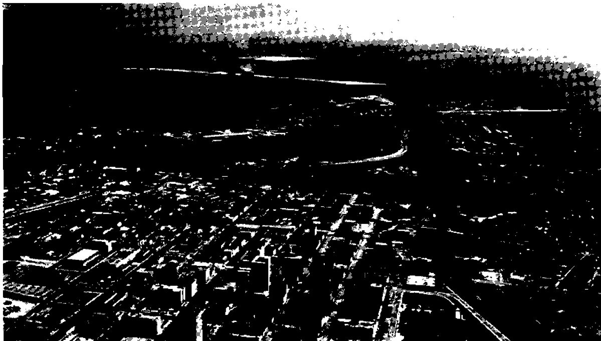
The City of Tampa and Tampa Bay represent the problem of the 1970's — People and Pollution. The Bay was the site of a recent oil spill.