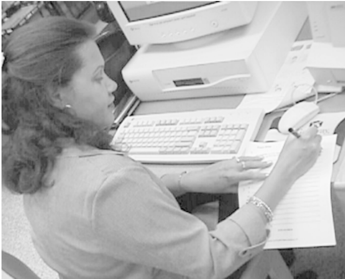
Library Web sites are increasingly offering Spanish-language interfaces, electronic databases, and other resources.