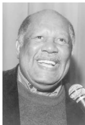
Author Ernest Gaines discussed his book A Lesson Before Dying as part of "If All of Seattle Read the Same Book."

A ll across the country, communities are coming together to talk about key issues raised in books, with a special focus on fiction. The current wave of interest started in Seattle when the Washington Center for the Book developed a program concept called "If all of Seattle Read the Same Book." A grant from the Lila Wallace Reader's Digest Foundation funded the start-up effort. "Toolboxes" for