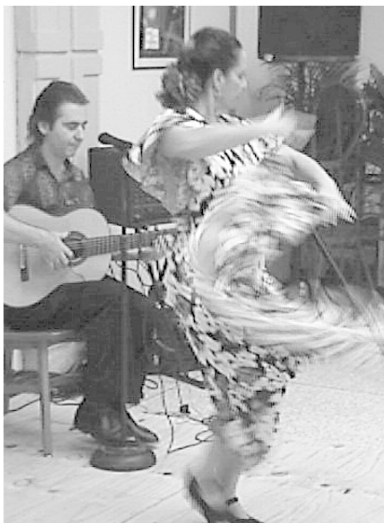
Library programs, such as this flamenco performance at the Hialeah Public Library, often feature Hispanic culture.

“In promoting library services to a Spanish-speaking population, it is critical to use Spanish media to spread the word.”