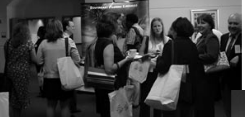
The SEFLIN Energize Conference offers opportunities for networking and discussing issues related to public services.

The SEFLIN Energize Conference has become an event for learning about and discussing topics related to innovative library services. Over the past ten years, presenters and participants have discussed the future of reference, as well as emerging trends in reference. The topics of discussion have changed, as has the focus on technology. Survey results have reflected this. Librarians want to hear more on how the use of technology has changed reference services and how to adapt to these changes. Conference participants have discussed e-mail reference, chat reference, roving reference,