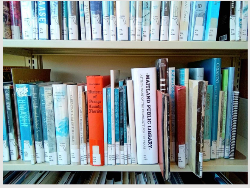
Maitland Public Library's hidden cache