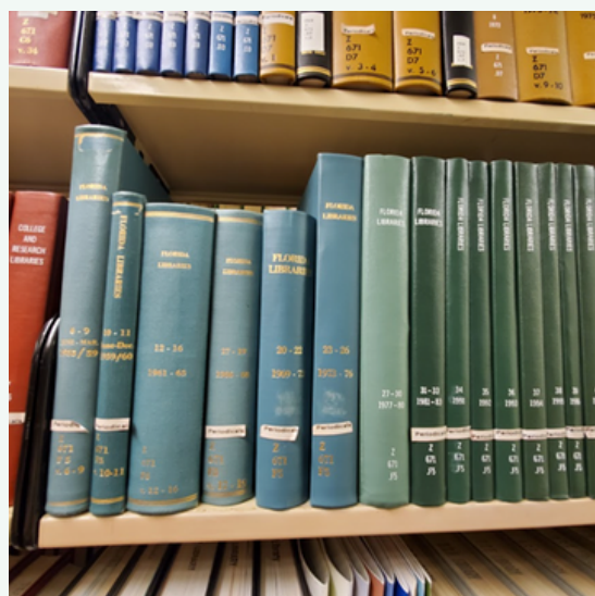
Image 2: Past Issues of the Florida Libraries Journal circa 1959-the 1990s