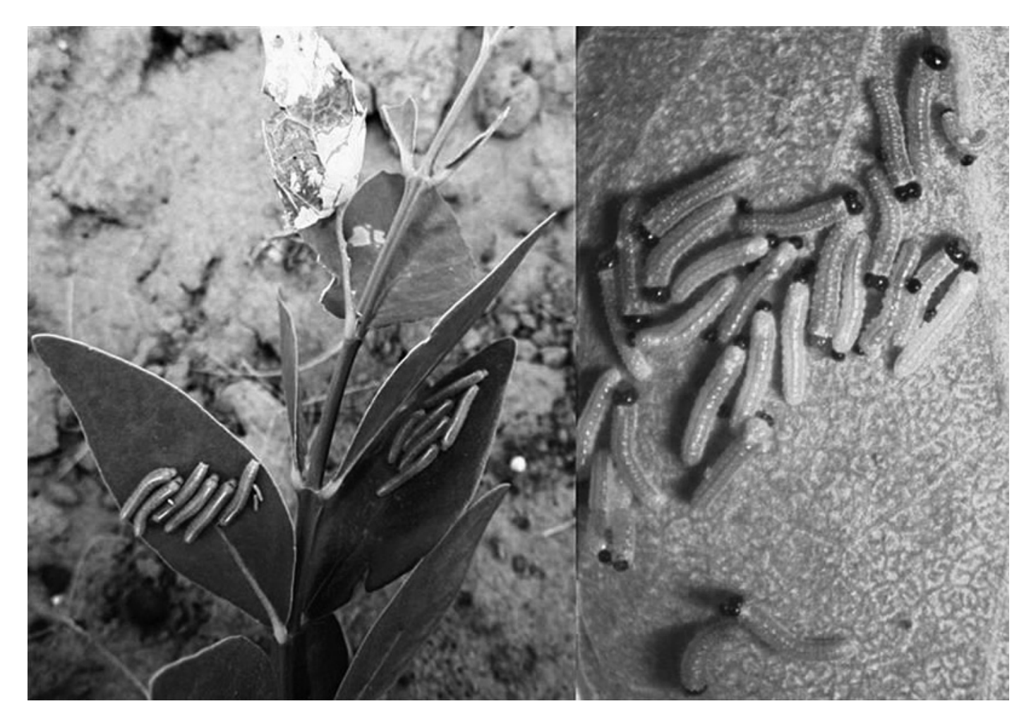
Fig. 1. Aggregation of Colotis amata on a pilu plant (Salvadora persica) during the winter season at the ICAR Central Institute for Arid Horticulture, Bikaner, India.