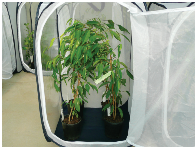
Fig. 2. Four Ficus benjamina plants inside a collapsible cage.

Fifteen rearing cages, 61 × 61 × 91.5 cm (24 × 24 × 36 inch), were used to house young fig trees in a greenhouse, with 4 fig trees per cage (Fig. 2). The collapsible white mesh (90 µm) had 3 mesh sides for ventilation and 1 clear vinyl side for easy viewing (Bioquip, California, USA). Thirty young plants 30 to 40 cm (12 to 16 inch) in height of F. benjamina (unregistered cultivar 'Cairns benjamina' voucher: Cairns ex. cult. Dec 2013 Field A.R. ARF4051 CNS) and 30 young plants of F. microcarpa (unregistered cultivar 'Cairns hillii' voucher: details Cairns ex cult. Dec 2014 Field A.R. 4055 CNS) were purchased from Limberlost Nursery, Freshwater, Cairns, Australia, and care was taken to ensure that the plants were free from all invertebrates and insecticides. The plants were foliar sprayed with a non-residual pyrethroid insecticide and washed 28 d before the start of the experiments. Five cages were set up with 4 F. microcarpa plants in each cage (no-choice), 5 cages with 2 F. microcarpa plants and 2 F. benjamina plants in each cage (choice) and 5 cages with 4 F. benjamina plants in each cage (no-