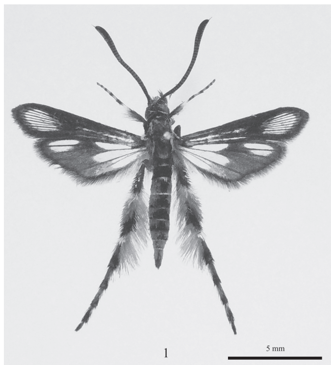
Fig. 1. Male of Pyrophleps bicella Xu & Arita sp. nov.