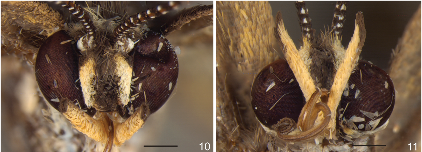
Figs. 10–11. Head of the female of Napaea joinvillea Hall & Harvey, 2005. 10. Anterior view; 11. Ventral view. Scale bar = 0.5 cm.