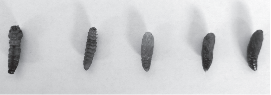
Fig. 2. Pre-pupae and pupae of Melitara prodenialis reared on artificial diet.

sequent generations become adapted to laboratory rearing conditions.