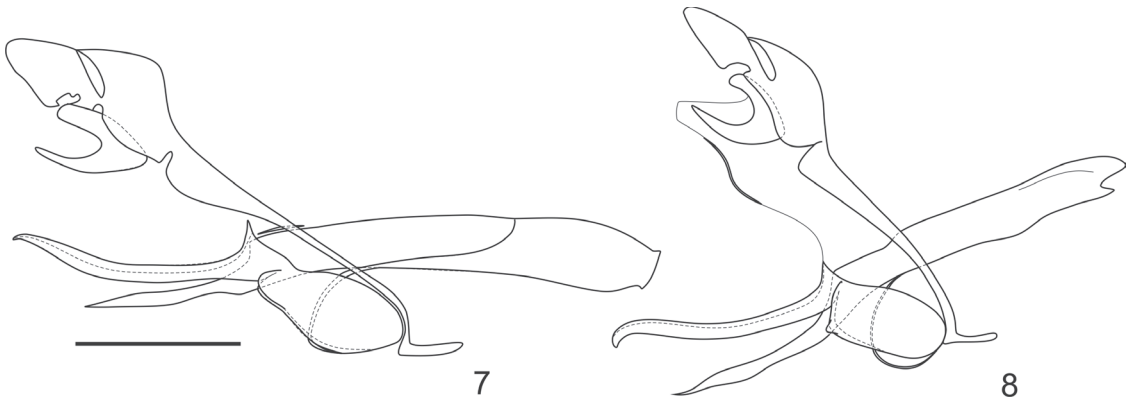
Figs. 7 and 8. Male genitalia of species of Eurybia [Illiger], 1807, lateral view; (7) Eurybia gonzaga sp. nov. , paratype from São Lourenço da Mata, Pernambuco, Brazil (MGCL); (8) Eurybia pergaea from Rio de Janeiro, Rio de Janeiro, Brazil (DZUP). Scale bar = 0.5mm.

thin, long—about half the size of the aedeagus—and posteriorly projected, curved dorsally and distally pointed, base of this projection slightly wider with a small dorsal projection; inferior part of the valva stout, somewhat rounded but irregular shaped, larger dorsoventrally, dorsally lobed and smaller, ventrally more or less rounded and larger; aedeagus cylindrical, almost straight, 3 times longer than tegumen and the uncus combined; anterior opening of the aedeagus small and circular; posterior opening of the aedeagus dorsal and long, about one third the size of the aedeagus; vesica without cornuti.