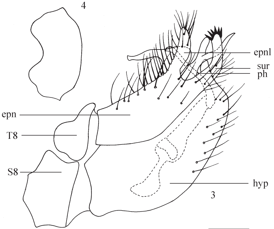
Figs. 3 and 4. Heleodromia (Neoillesiella) orientalis sp. nov. (male). 3. Genitalia, lateral view; 4. Tergite 8, dorsal view. Abbreviations: epn = epandrium; epnl = epandrial lobe; hyp = hypandrium; ph = phallus; s8 = sternite 8; sur = surstylus; t8 = tergite 8. Scale bar = 0.1 mm.

Abdomen black with pale gray pollinosity; hypopygium partly brownish yellow. Setulae and setae on abdomen dark yellow except hypopygium with some blackish setulae and setae.