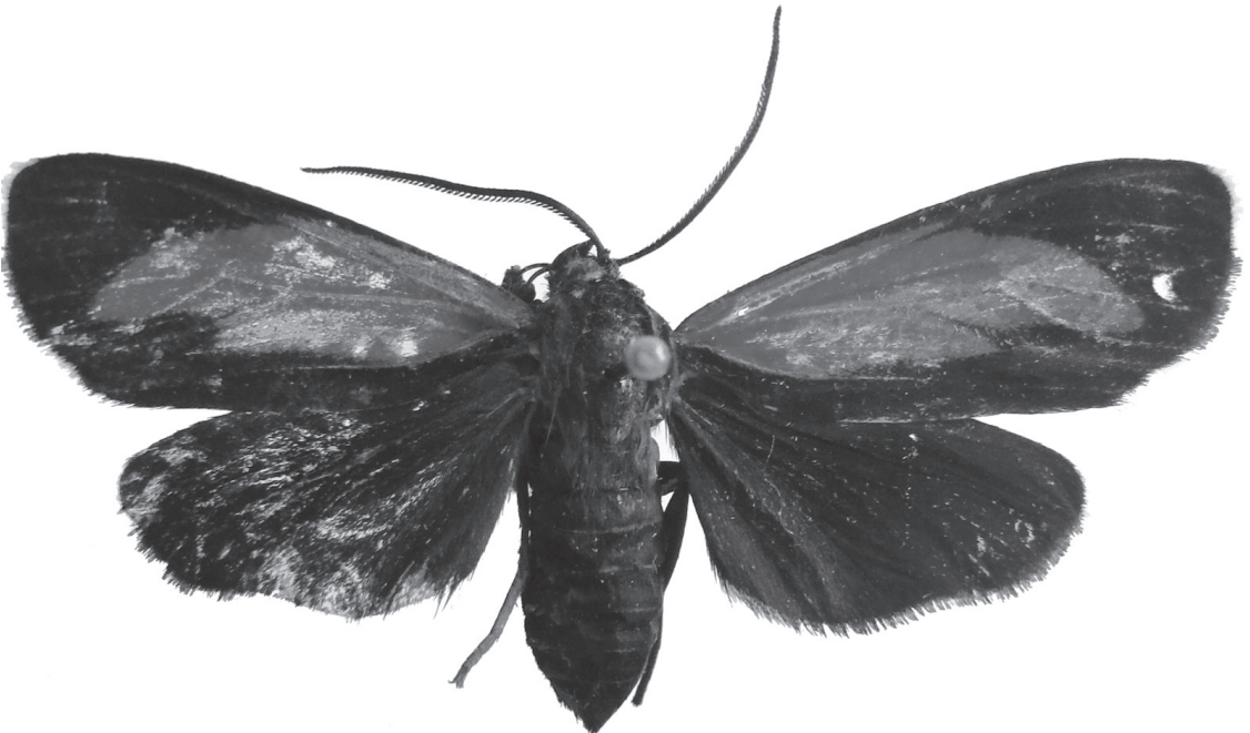
Fig. 1. Specimen of Cyanopepla griseldis (Druce, 1884) deposited at Semarnat/Cites/CP-0026-Ver/05 Scientific Collection, Mexico.