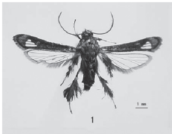
Fig. 1. Oligophlebia minor Xu & Arita sp. nov. , male, holotype.