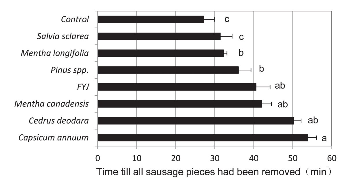
Fig. 3. Effect of plant essential oils on the time (min) required by Solenopsis invicta workers to remove all 8 of the ~ 62.5 mg fragments of sausage placed on a piece of filter paper treated with an essential oil. Each piece of filter paper was placed 15 cm from the perimeter of the fire ant mound. FYJ is a mixture of menthol, methyl salicylate, camphor, eucalyptus oil and eugenol. Means ( \pm SE) followed by the same letter are not significantly different (LSD) at level of 0.05.

tested. The concentration of essential oils used in this experiment was 10<sup>s</sup> ml/ml, but different concentrations may alter the effectiveness of a repellent (Chen 2009). Future research should consider this possibility. Our study also revealed that the number of worker ants involved in foraging activities tended to increase over time. This may due to the gradual decrease of the repellent effect of essential oils. It is probable that lower repellency occurred because the outdoor air-flow accelerated the evaporation of the essential oils. Perhaps micro-capsules could be developed to ensure a greater stability of the repellent effects.