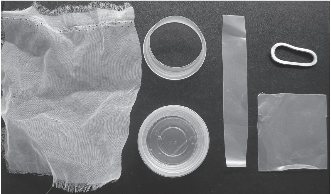
Fig. 1. Material for the assembly of a feeding chamber for Myzus persicae . The feeding chamber was constructed of the following items: 2 plastic tumblers of double-nought number [40 × 20 mm] (1a), one of which is open on both sides (1b), 2 pieces of Parafilm, one of which is larger and more narrow than the other (1c), a rubber band (1d) and a piece of thin fabric (1e).