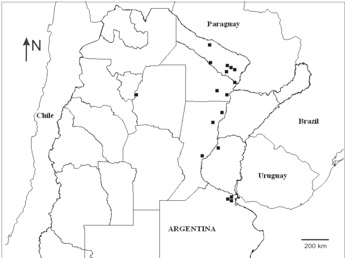
Fig. 11. Map of Argentina with collection sites for Lepidelphax pistiae gen. et sp. nov. (black squares).

Male: Small to medium-sized, predominantly brachypterous forms.