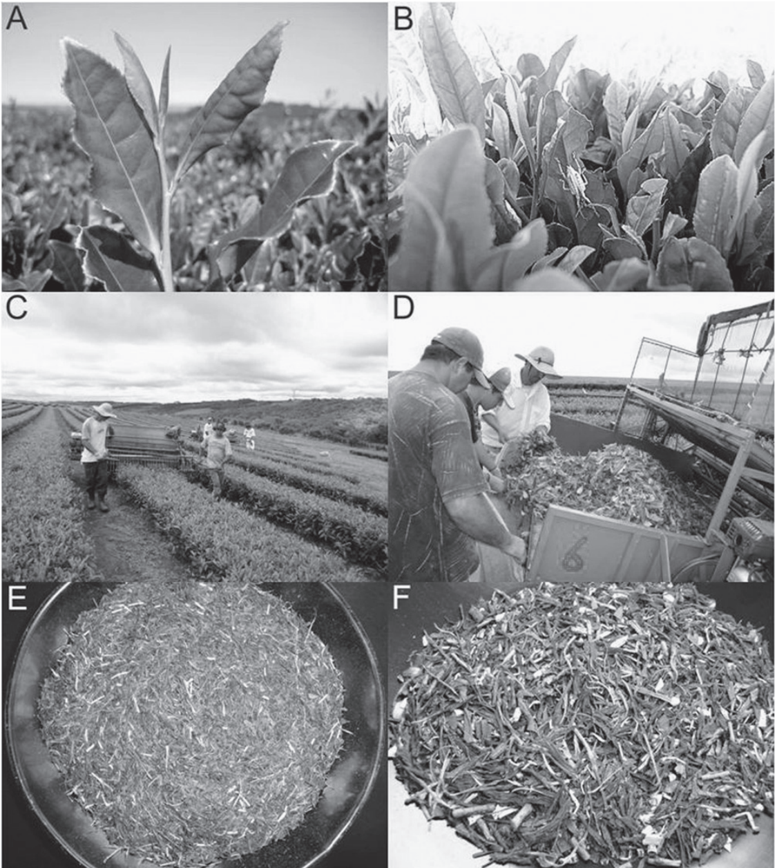
Fig. 2. A. Camellia sinensis leaves; B. Compsus niveus on tea leaf; C. Collection of leaves; D. Withdrawal of leaves collected; E. Prepared product to be packaged; and F. Tea with fragments (white) of the curculionid's carapace, legs and wings.

color, together with the dehydrated leaves, thus devaluing the product and destroying its commercial value, and ultimately affecting the exportation of green tea (Fig. 2F).