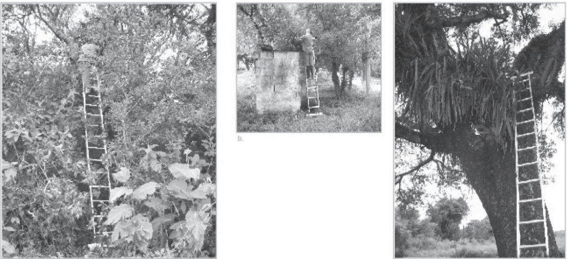
Fig. 2. Mosquito habitats provided by the Aechmea distichantha , a bromeliad epiphyte in the Yungas of north-western Argentina. (2a) Aspect of residual primitive forest in Monte Bello, meters from bromeliads where larvae of Ae. aegypti were found. (2b) Aspect of the abandoned building where epiphytic bromeliads were found from which the larvae of Ae. aegypti were collected. (2c) Epiphytic bromeliads from which larvae of Ae. aegypti and Cx. quinquefasciatus were collected at Iltico.

and Cx. quinquefasciatus in bromeliads located in wild and semi-urban environments could indicate a possible degree of invasion and adaptation to the primitive forest, or they may be a consequence of high infestations levels in nearby houses (Malta Verajao et al. 2005). This finding requires in-depth studies to reveal the real behavior of these