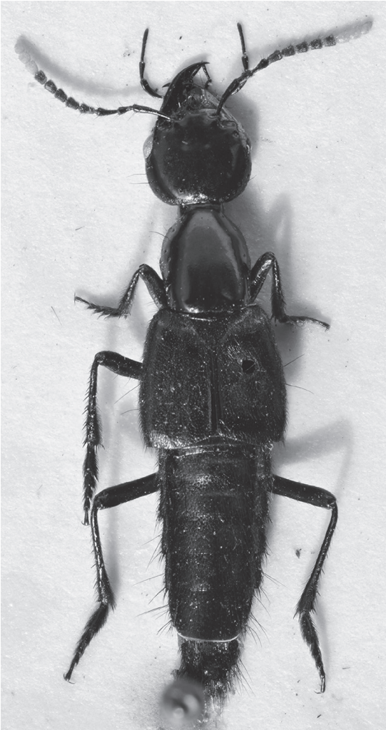
Fig. 1. Holotype of Cafius splendoris

Examination of the holotype of C. splendoris (Figs. 1 and 2) reveals that the specimen represents a species of Hesperus Fauvel. It lacks the diagnostic characters of Cafius but corresponds well to the diagnostic characters for Hesperus : maxillary and labial palps elongate, maxillary palpomere 3 more or less 2.0 times as long as wide, labial palpomere 2 more than 2.0 times longer than wide; largest lateral macrosetal puncture of pronotum separated from lateral margin by more than 3.0 times width of puncture; mesoventrite with rounded intercoxal process; outer edge of front tibia with spines; front tarsomeres 1-4 each with modified pale setae on ventral surface. We herein, transfer C. splendoris to the genus Hesperus .