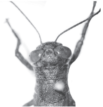
Image 4. Clonacris kirbyi Finot Dorsal view of head

Fig. 1. Clonacris kirbyi Finot collected at Patgaon, Taluka Chandgad, Dist., Kolhapur [N 16° 07' 40.66" E 73° 56' 04.15", 2098 ft (639.5 m) asl], northwestern Ghats, Maharashtra, India.