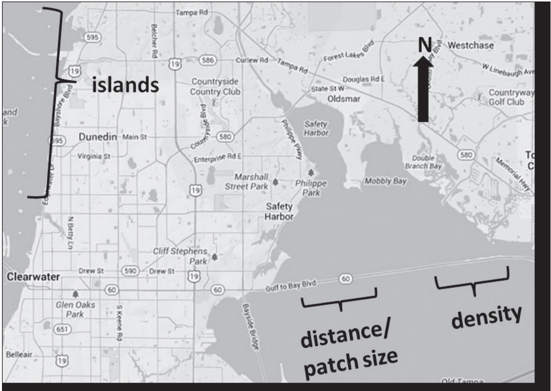
Fig. 1. Map showing overview and relative location of each of the 3 studies. Tampa (Hillsborough County), Florida is to the east.

east side of the CCC bridge is an extensive area of B. frutescens forming a continuous ground cover matrix with I. frutescens shrubs emerging intermittently, such that the distance between the host species is zero; moreover, relative host plant abundances vary with varying Borrhichia stem density (Fig. 2). Monthly gall counts were performed from Jan 2009 to Sep 2009 to determine gall densities on I. frutescens and B. frutescens . Additionally, areal density of potential oviposition sites (leaf buds) on Borrhichia on both sides of each I. frutescens shrub in the study was measured and the local average determined. Emergence holes were counted concurrently on both species and classified according to whether they were the result of emerging gall midges or parasitoids (Stiling & Rossi 1997). Linear regression analysis was performed using I. frutescens gall density and parasitism rate as response variables and B. frutescens gall density, oviposition site areal density and parasitism rate as independent variables influencing Iva gall density. We predicted Iva gall density to be lower and parasitism rate higher as Borrhichia gall density, oviposition site density and parasitism rate increased.