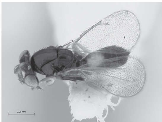
Fig. 2. Male Aprostocetus ( Aprostocetus ) sp. (all females were slide mounted for identification and were not photographed prior to mounting). The color version of this figure is available online in Florida Entomologist 96(2) (2013) at http://purl.fcla.edu/fcla/entomologist/browse .