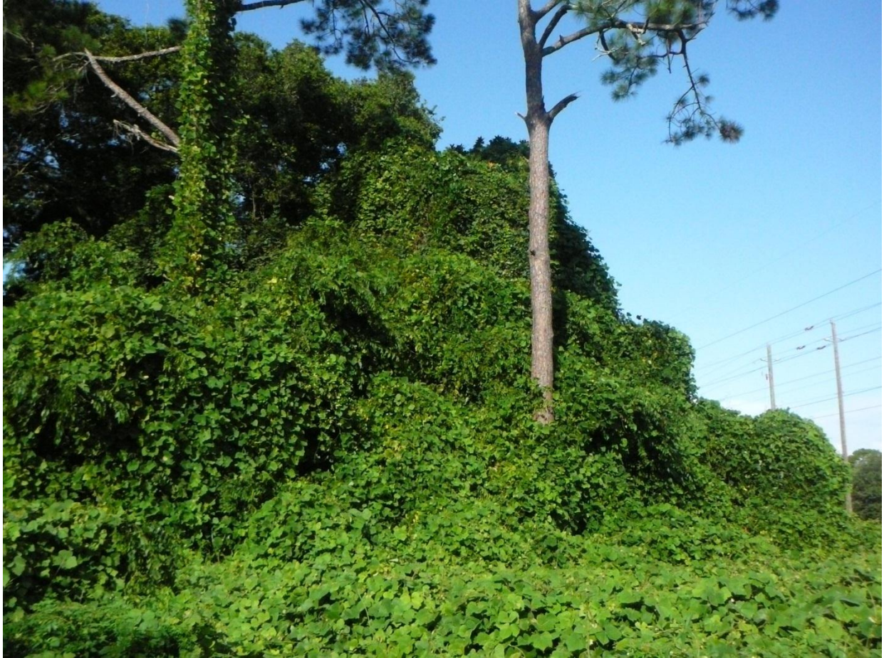
Fig. 2A. Kudzu and Megacopta cribraria in Florida. A. Kudzu patch in Alachua County, Florida.