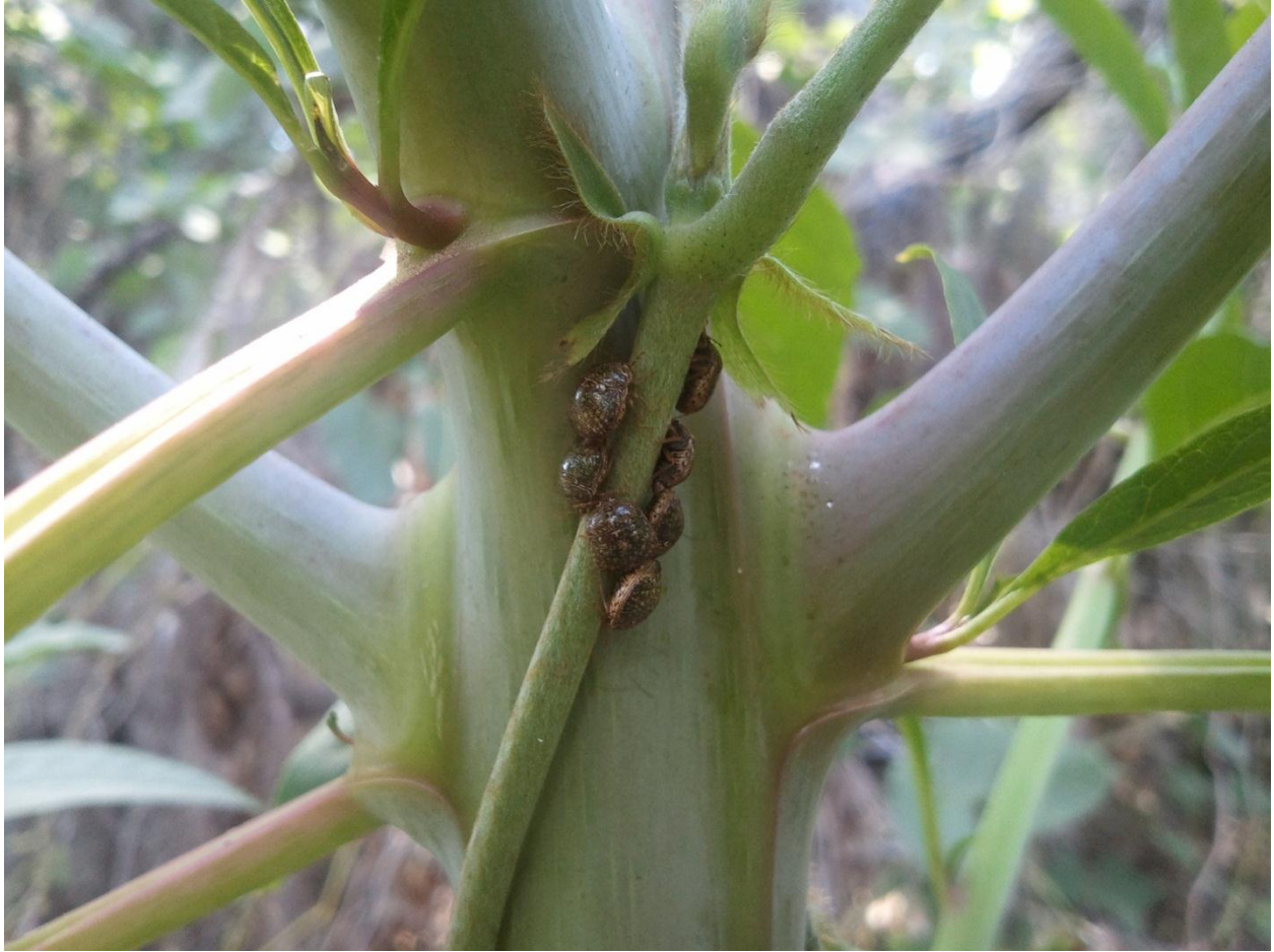
Fig. 2B. Kudzu and Megacopta cribraria in Florida. B. Megacopta cribraria on kudzu in Jefferson County, Florida.