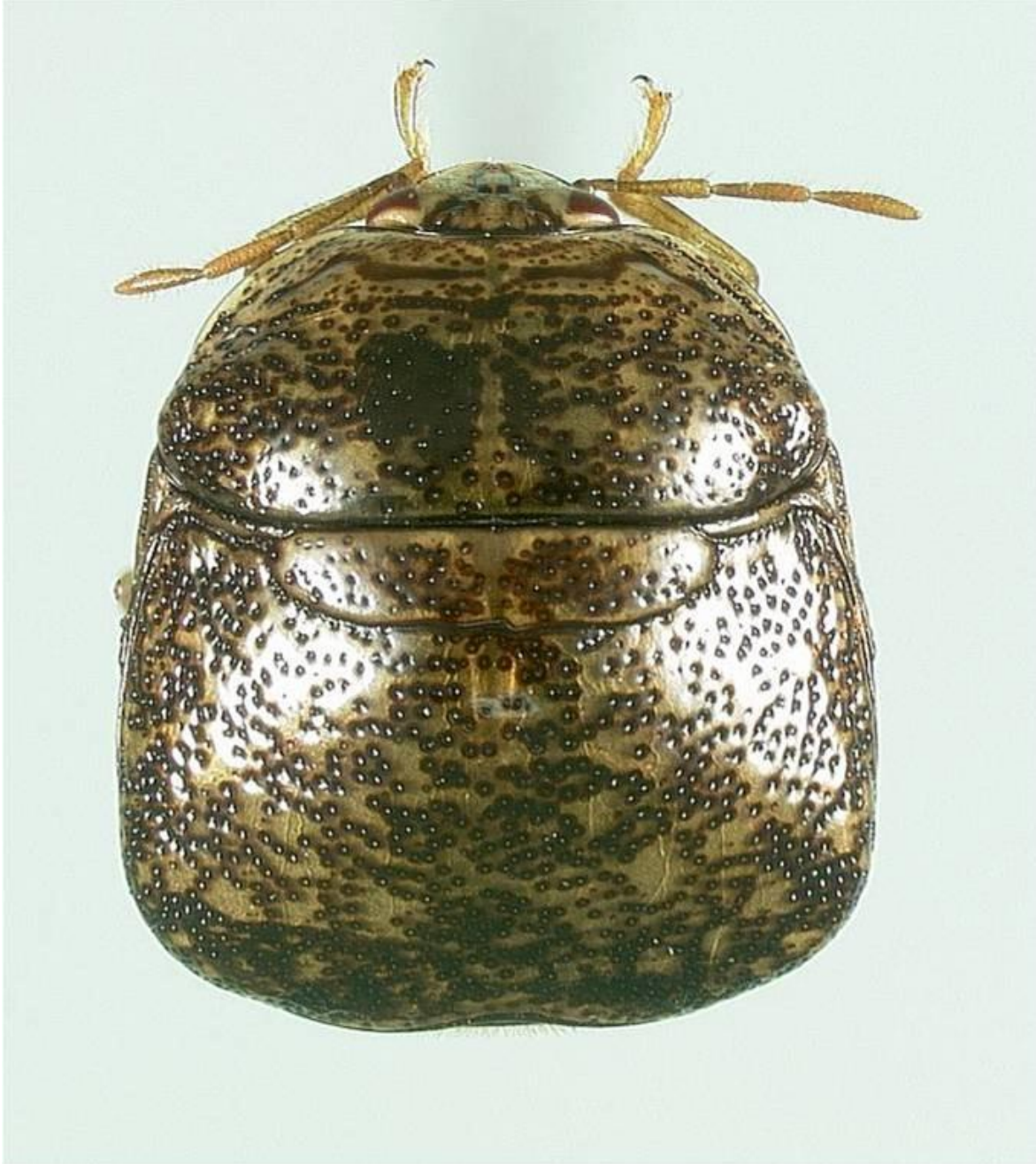
Fig. 2C. Kudzu and Megacopta cribraria in Florida. C. Dorsal view of a male Megacopta cribraria .