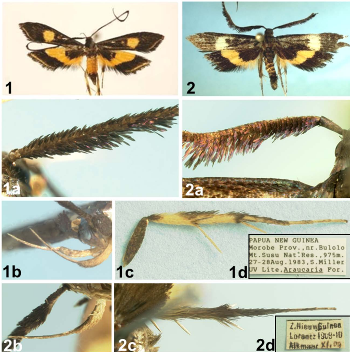
Figs. 1–2. Adults, antenna, labial palpus, and hind tibia of Hannara . 1, Adult of H. buloloensis sp. nov. Park; 1a, antenna of female; 1b, labial palpus; 1c, hind tibia; 1d, label of the holotype. 2, Adult of H. genialis sp. nov. Park; 2a, antenna of male; 2b, labial palpus; 1c, hind tibia; 1d, label of the holotype.