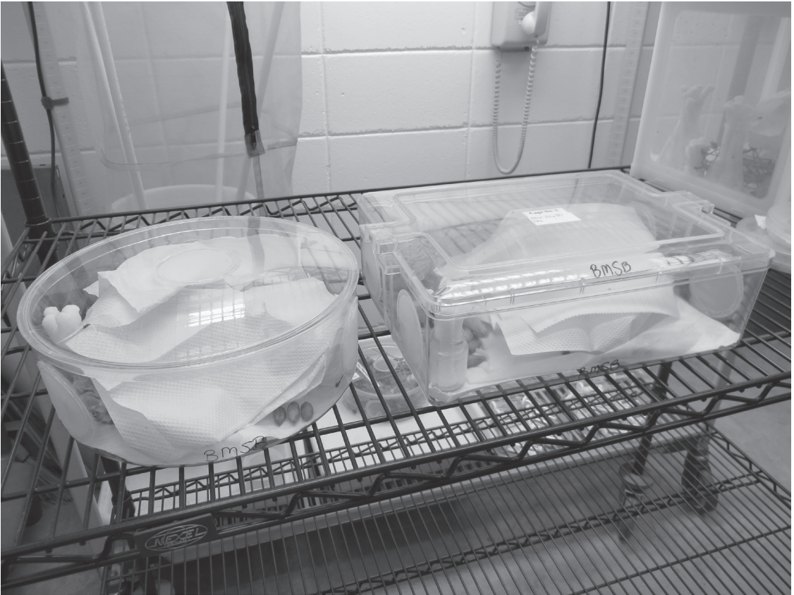
Fig. 1. Clear plastic rectangular and circular containers for rearing Halyomorpha halys .

significantly improved the BMSB rearing success. Other foods occasionally added to the diet included raisins [ Vitis vinifera L. (Vitaceae)], apple [ Malus pumilla Mill. (Rosaceae)], papaya [ Carica papaya L. (Caricaceae)], mango [ Mangifera indica L. (Anacardiaceae)], okra, orange [ Citrus sinensis (L.) Osbeck (Rutaceae)], tangerine [ Citrus tangerine (Tanaka) Tseng (Rutaceae)], cucumber [ Cucurbita sativus L. (Cucurbitaceae)], jalapeño [ Capsicum frutescens L. (Solanaceae)], tomato [ Lycopersicon esculentum Mill. (Solanaceae)], strawberry [ Fragaria × ananassa (Rosaceae)], common ragweed [ Ambrosia artemisiifolia L. (Asteraceae)] bouquets and other seasonal produce. Layers of Kimwipes® Kimberly-Clark and paper towels were placed inside the containers to provide an oviposition substrate, hiding places, and additional surface area. Egg masses were hand collected every other d. This method proved to be very effective for obtaining fresh high quality eggs (Fig. 2). To avoid egg predation by adults and to avoid overcrowding, egg masses were collected regularly and placed in a separate labeled container. Nymphs tended to feed on the eggs, and