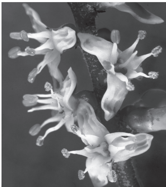
Fig. 1. Flowers of Serenoa repens .

Insect flower visitors were collected from saw palmetto as part of a long-term survey of all flower visitors on flowers of all species in all habitats at the ABS. This project was begun in 1984 and has continued, sometimes at a low level, up to the present. This has been a simple diversity survey; no attempt was made to assess the abundance of