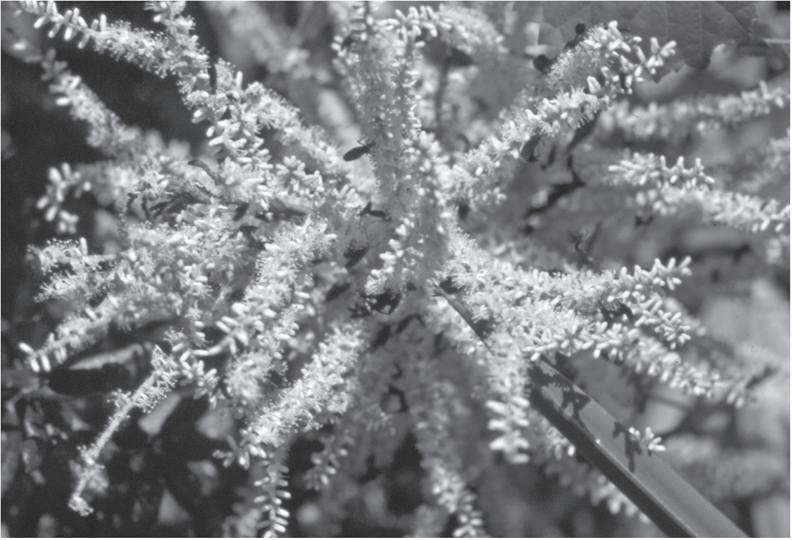
Fig. 2. Inflorescence of Serenoa repens .

insect species or pollination effectiveness on species of floral hosts, nor was there any attempt to devote equal effort to each plant species.