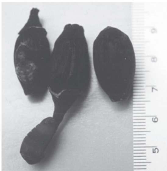
Fig. 3. Larva of Thepytus echelta (Lycaenidae) on the peduncle of Psittacanthus acinarius (Loranthaceae) fruit.

only species that expressed some potential for use as a biological control agent against this mistletoe. This is because the caterpillars produced a hole in the pericarp of the fruit to reach the seeds that indeed they did eat, thus eliminating the cotyledons and the viscin. Because of this behavior T. echelta may completely impede seed germination. However, their population during the period of the survey was very low (Table 2).