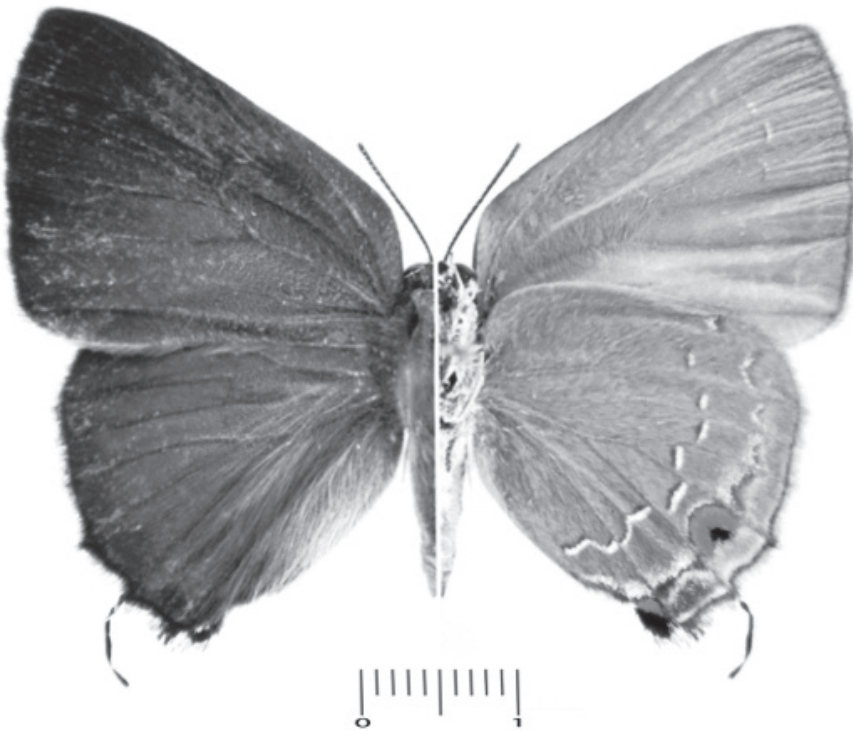
Fig. 2. Male (above) and female (below) of Thepytus echelta (dorsal [right] and ventral [left] views, respectively) (Photos by Marcelo Duarte-USP, SP).