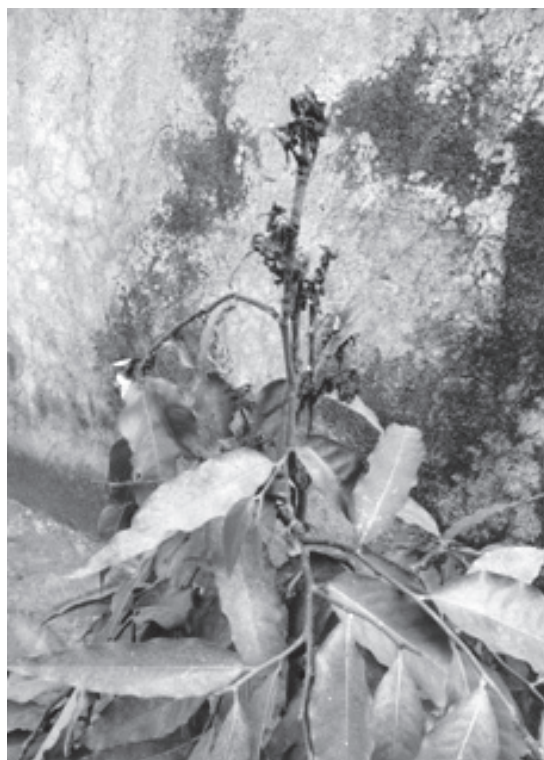
Fig. 4. A 6-month old Polyalthia longifolia plant severely damaged by Crotonothrips polyalthiae .

The presence of this leaf-galling thrips significantly affected plant height, stem circumference, and the number of healthy young leaves produced by the experimental plants (Table 3). Pre-treatment observations showed that there were no significant differences in plant height, stem circumference, and the number of uninfested young