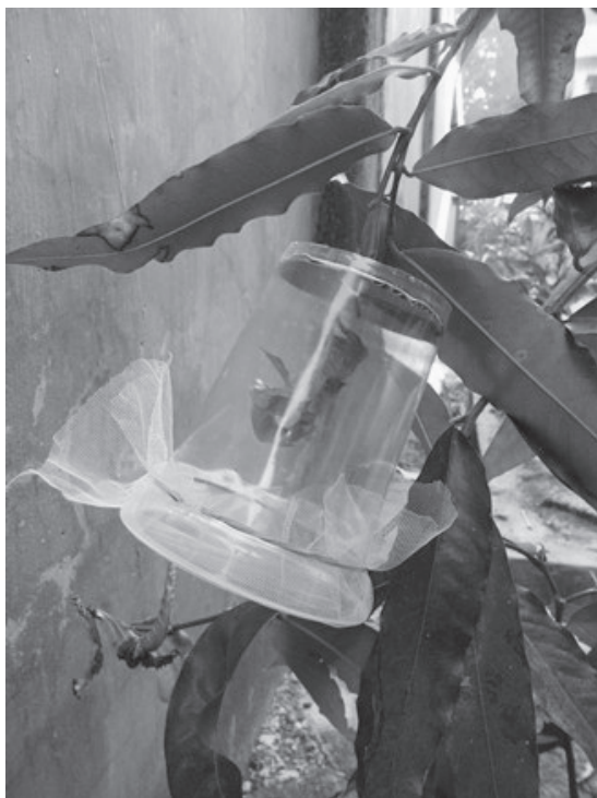
Fig. 1. Thrips cage used in studying the life cycle of Crotonothrips polyalthiae on Polyalthia longifolia .

as described above (Fig. 1). Ten 3-month old P. longifolia trees were used in this study and two cages were used on each tree. The cages were opened every 24 h to check the condition of the adults (alive or dead) and the presence of natural enemies and thrips larvae. Adult longevity was determined by counting the number of days from when the thrips were placed onto the leaves until they died. Dead adults were collected in a small vial with 70% ethanol for checking whether they were females or males under a microscope. Every newly formed larva was counted and recorded and then removed from the gall. Two weeks after both adults died, the number of unhatched eggs in each gall was counted under a dissecting microscope (50 to 100X). The percentage of hatching eggs was calculated using the following formula: