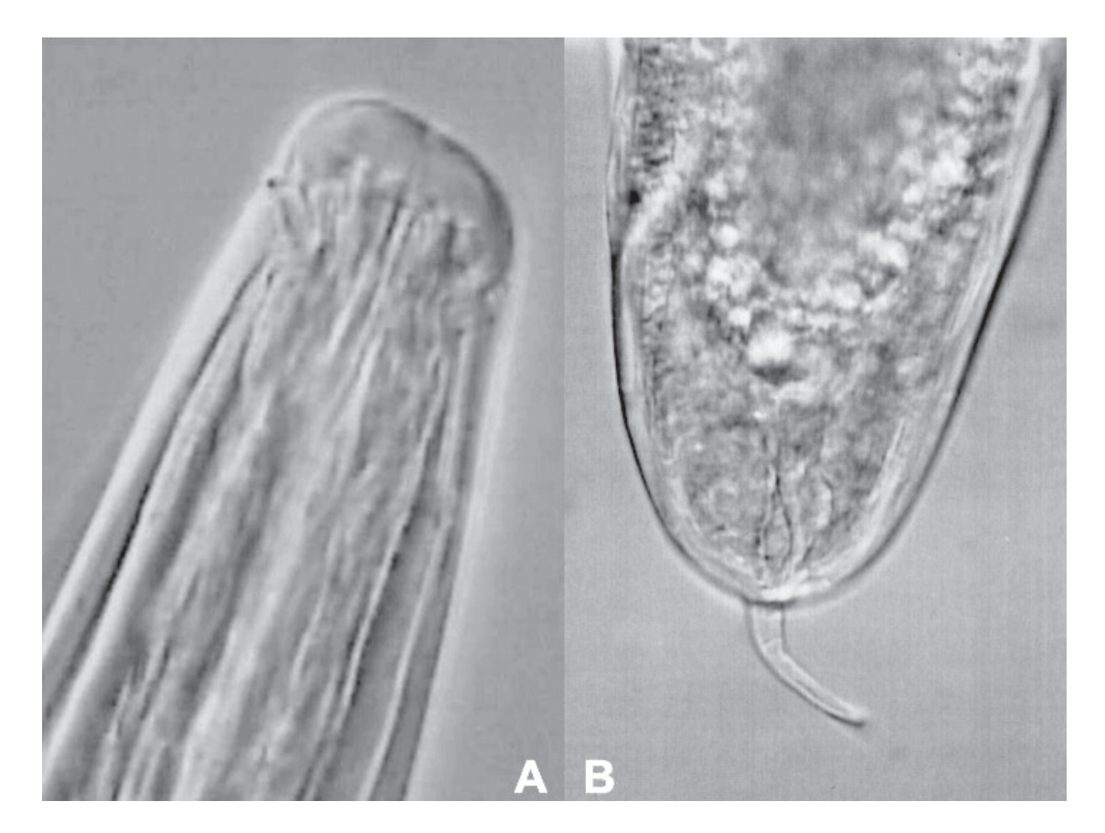
Fig. 2. Nematode infesting Acrosternum hilare adult as seen with a differential interference contrast optics microscope. 2A. Anterior end of the mermithid nematode. 2B. Posterior end of the mermithid nematode showing the caudal appendage that is common in the genus Hexamermis

(Coleoptera: Chrysomelidae) (Bozhkov & Kaitazov 1976), and the horned beetle, Diloboderus abderus Stur (Coleoptera: Scarabaeidae) (Achinelly & Camino 2008). Other stink bugs have also been infected with Hexamermis sp. These include Rhaphigaster nebulosa Poda (Manachini & Landi 2003) and the bark bug, Halys dentatus Fabricius (Dhiman & Yadav 2004). Halys denta tus was discovered to have about 9% parasitism by nematodes during a parasitoid survey in India (Dhiman & Yadav 2004). Parasitism levels are typically low for these insects, but may be a consistent contributor to natural mortality. Future research needs to focus on incidence and life cycles in relation to stink bug parasitism.