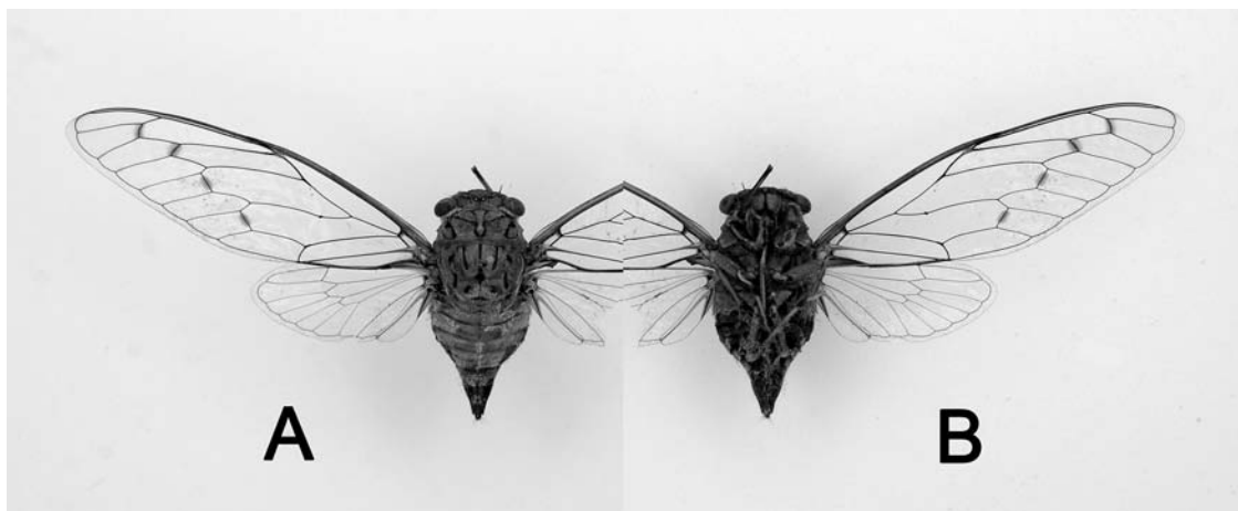
Fig. 2. Dilobopyga aprina Lee, sp. nov. , paratype, female, Sampuraga, Sulawesi, Indonesia, VII-1997. A. dorsal view. B. ventral view.

Pronotum ochraceous. Inner area of pronotum with a pair of central longitudinal fasciae, extending from anterior margin of pronotum to pronotal collar and dilated both anteriorly and posteriorly, a pair of short, oblique branches from middle of the central longitudinal fasciae along paramedian fissures, a pair of fasciae along lateral fissures, of which anterior end broadened, and a pair of curved fasciae along lateral margin of inner area, black to fuscous. Pronotal collar without